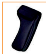
POUCH (SOFT CARRY CASE) COLOR: BLACK SIZE: 200X133X42MM