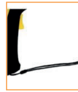
STRAP (WRIST STRAP) COLOR: BLACK SIZE: ~220MM