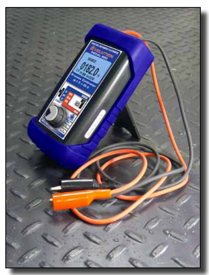
Flip out stand for bench use